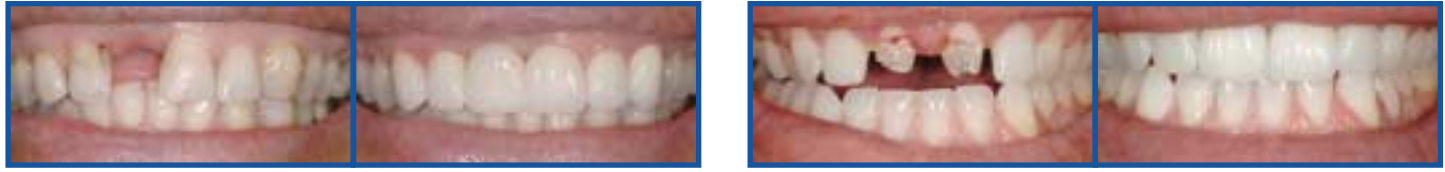
Actual Patient Treatments by Dr. Stephen Phelan

There is no need to suffer from tooth loss! Dr. Stephen Phelan can restore your smile, dental function and confidence with dental implants. Dental implants can make it possible for you to look better, feel healthier and enjoy eating again. Whether you are missing one tooth, many teeth, or all of your teeth, dental implants are often the preferred method of tooth replacement. There are many reasons for losing your teeth, including cavities, gum disease, bite problems, fractured roots, and accidents. When you loose your teeth the bone that surrounds and supports the tooth root deteriorates and melts away in a process similar to the atrophy that occurs in muscles from a lack of use. If you loose a tooth at the front of your mouth the result can be a visible defect in the bone and gums that is difficult to hide and will affect the appearance of your smile. The dental implant replaces the missing tooth root and preserves the remaining bone. Dental implants will make it possible to smile again with confidence and enhance your overall quality of life. If you would like to schedule a free dental implant consultation appointment with Dr. Stephen Phelan, please call our office at 905.827.1619.